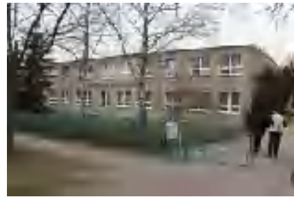
High School Neutrebbin / Brandenburg